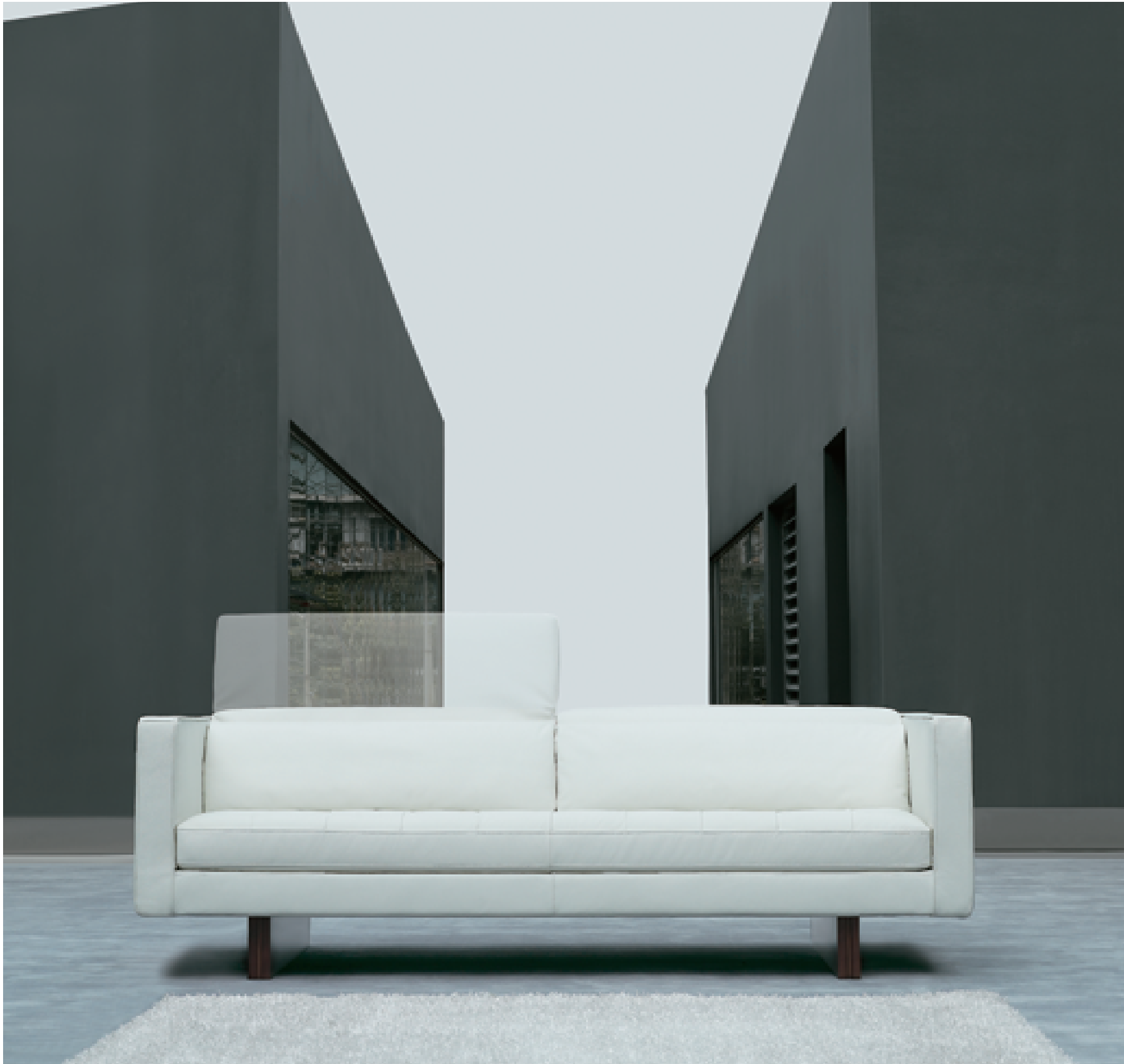
Being inspired by the western living room furniture style in the 50s/60s, Model FORETTI has the design characteristics of slim & tight arms, extra-tall legs, low back and squares-on-seats.