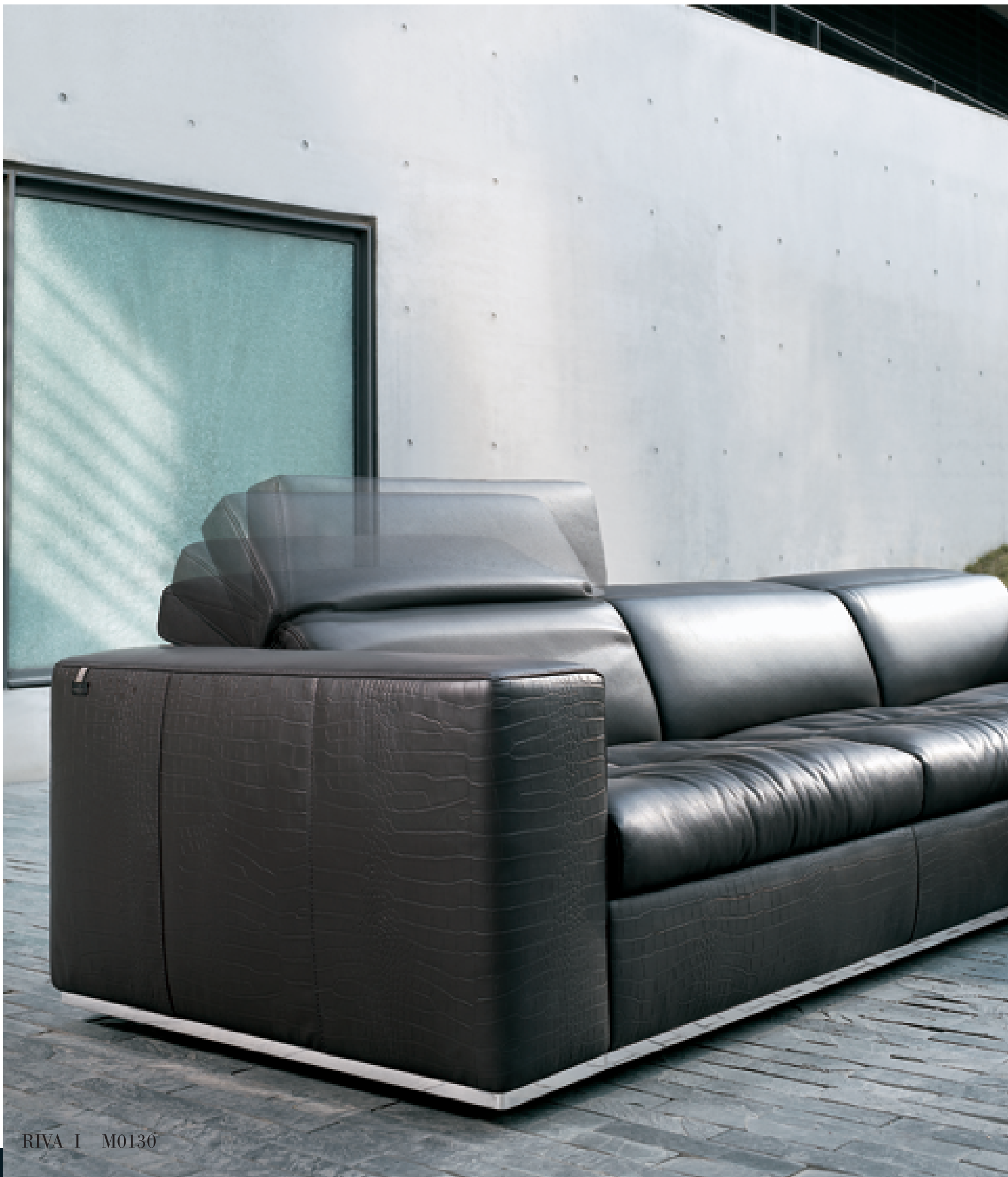
RIVA I M0130

German-made head mechanisms (with various locking positions) allow extra comfort when needed.