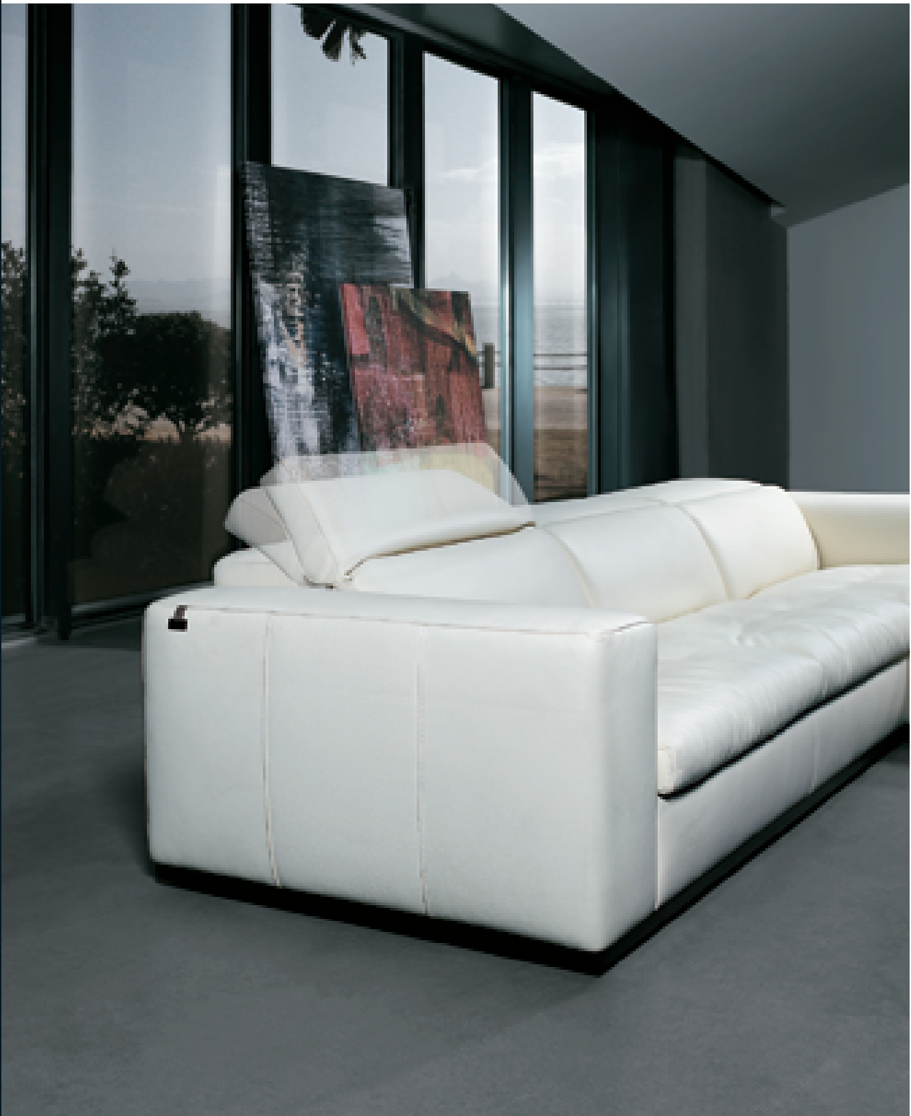
German-made head mechanisms (with various locking positions) allow extra comfort when needed.