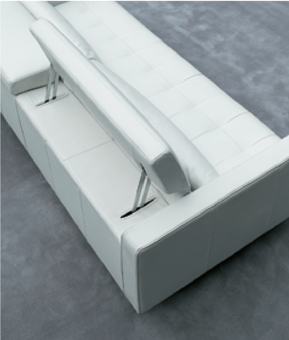
To give the modern seating comfort to this old-times inspired model, the flip-up head mechanisms (being supplied by Italian specialists) are the feature which certainly did not exist in the good old days.