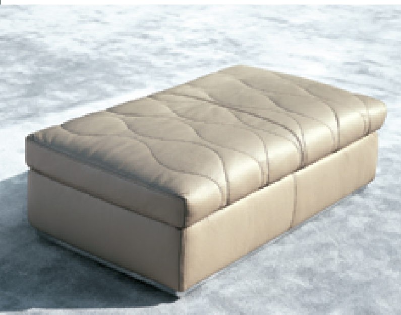
Optional stool (no. ST2) comes with matching designs.

Being inspired by the shape of waves, the repetitive patterns on seat cushions are NOT made by automatic stitching machines. Every stitching line is put-through by extremely skillful human hands.