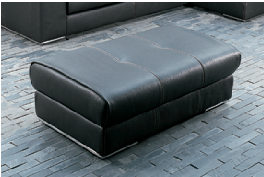
Optional stool (no. ST2) comes with matching designs.