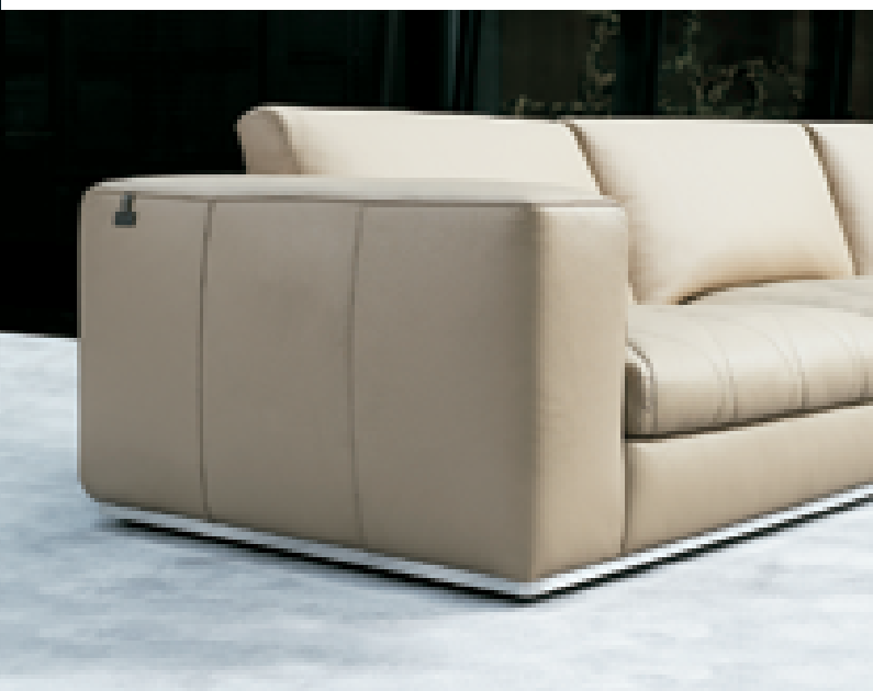
Square-shaped stainless-steel tubes as the sofa foot base makes it more unique and high-end comparing with the usually-seen round-shaped ones. The tubes go all the way around the sofa base enhance the luxury look of Model RIVA II.