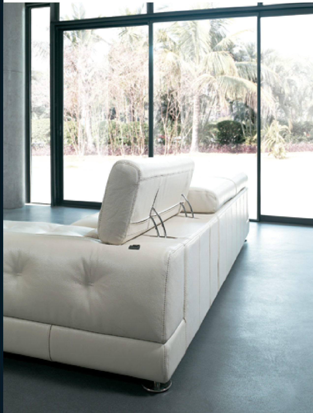
Tufted arm exteriors and seat tops give highlights to the model.