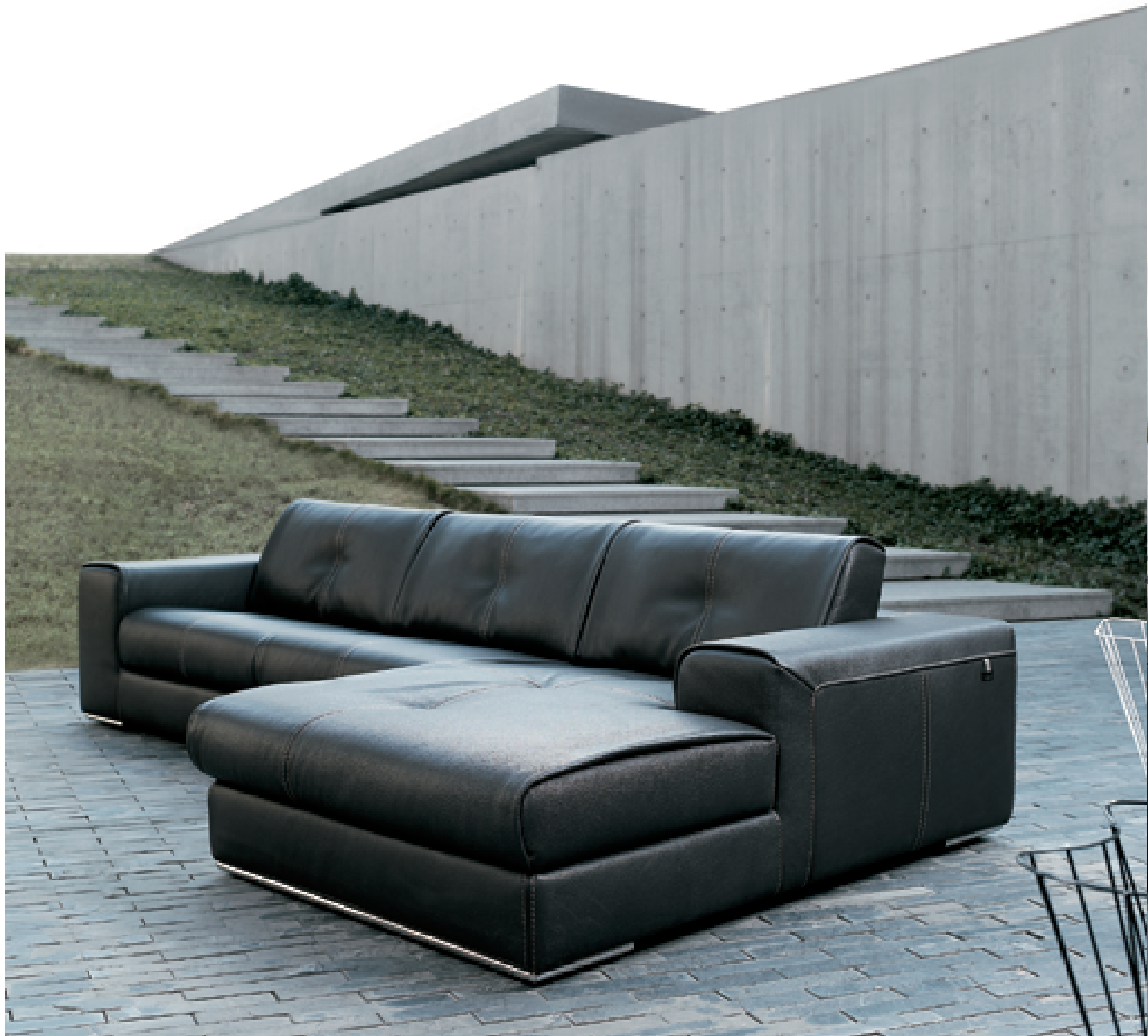
Model TOLENTINO was designed particularly for sofas being made with ultra-thick (around 3mm) leather.