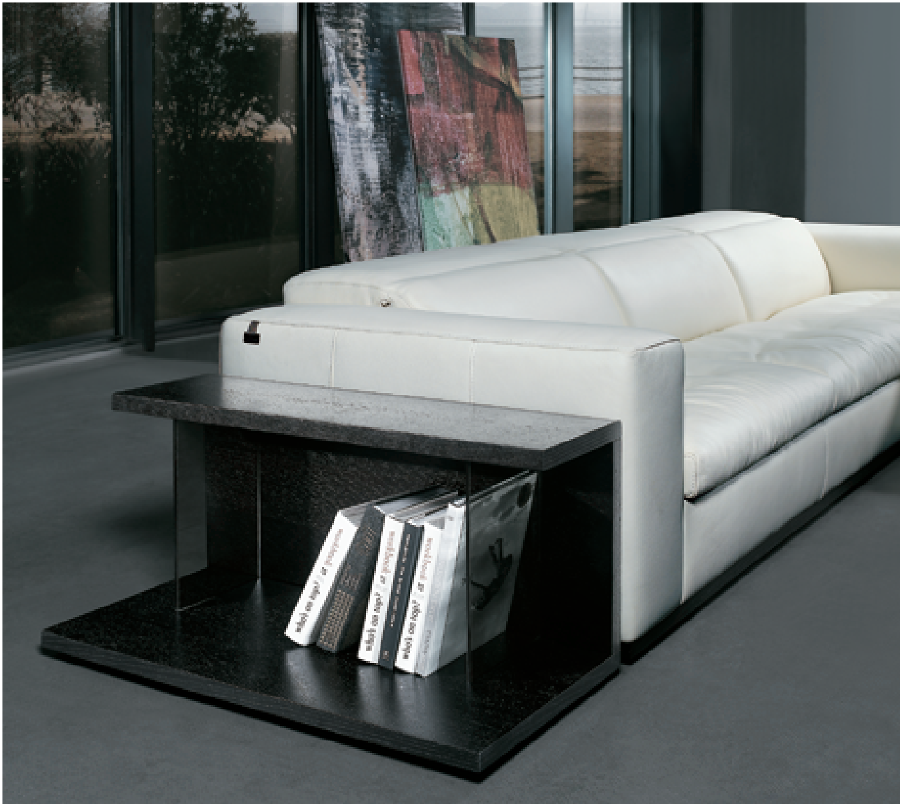
Optional wooden-shelf unit (no. WT01) with gray acrylic plates delivers the functional and decorative aspects of Model RIVA I.