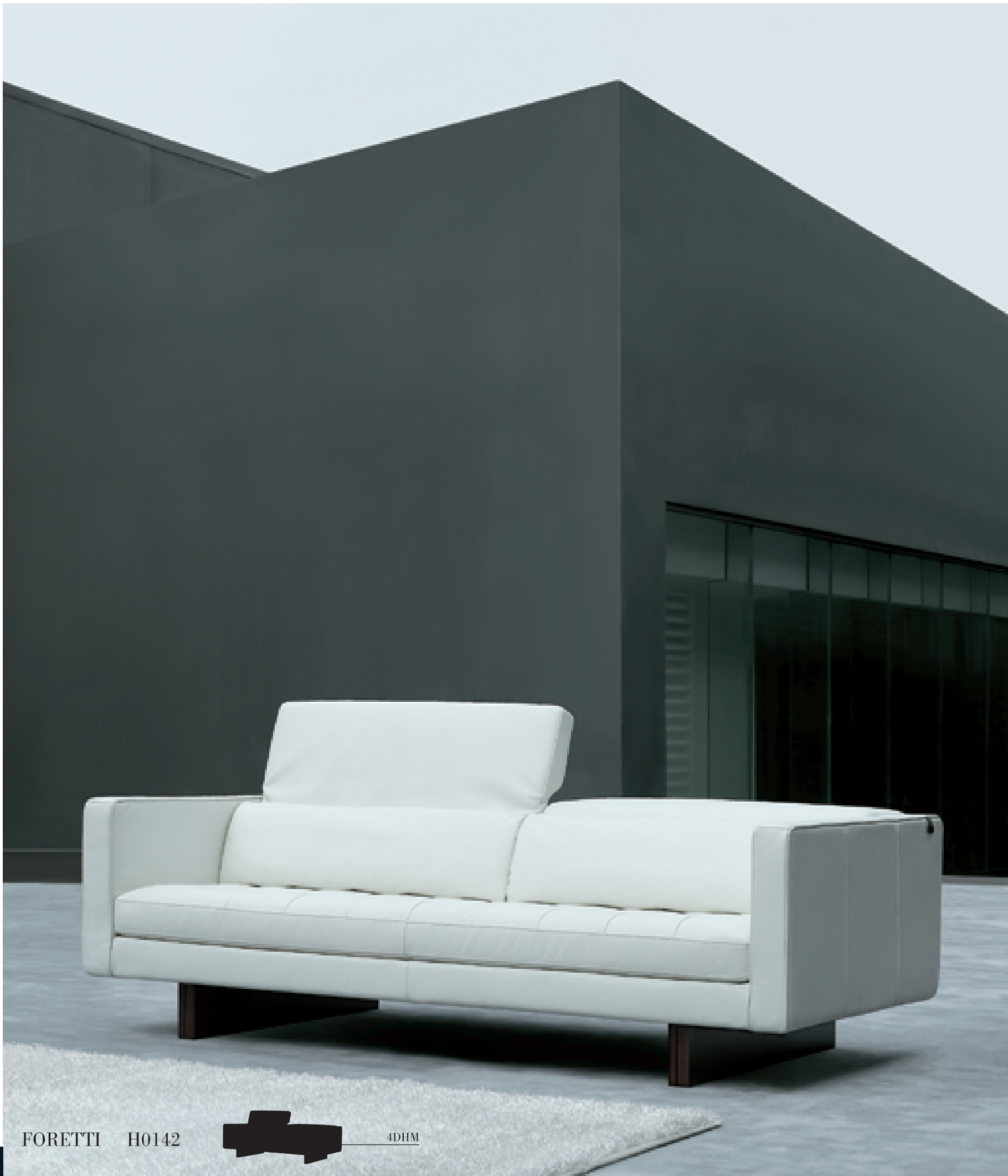
FORETTI H0142 4DHM