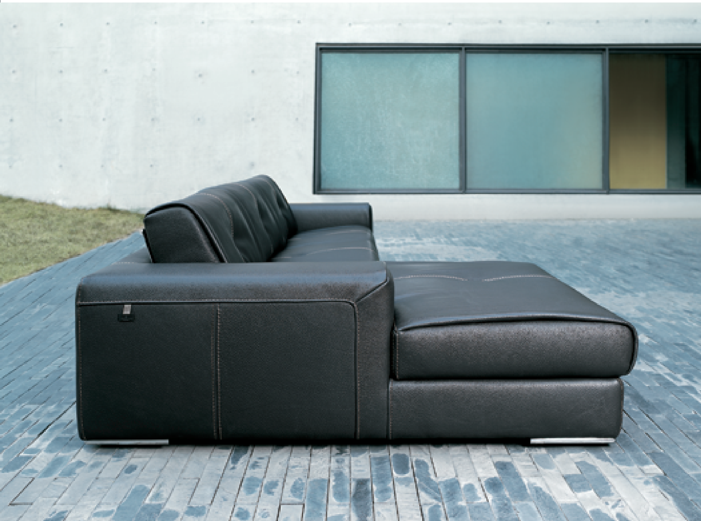
3mm ultra-thick leather is “folded” (instead of sewed) at the edges of sofa arms and cushions.