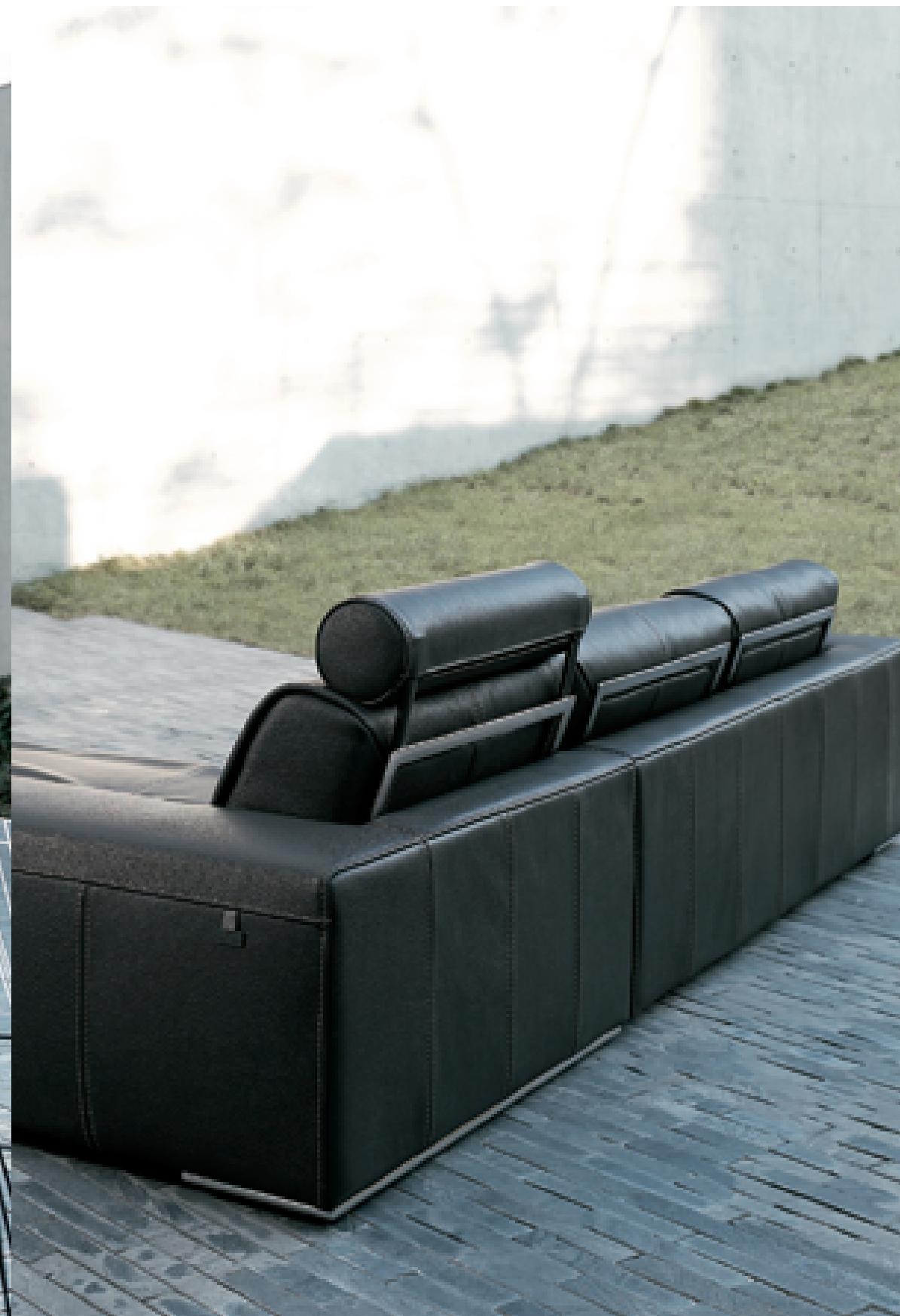
Solid stainless steel support at the back of every back cushion is decorative and uptrend.