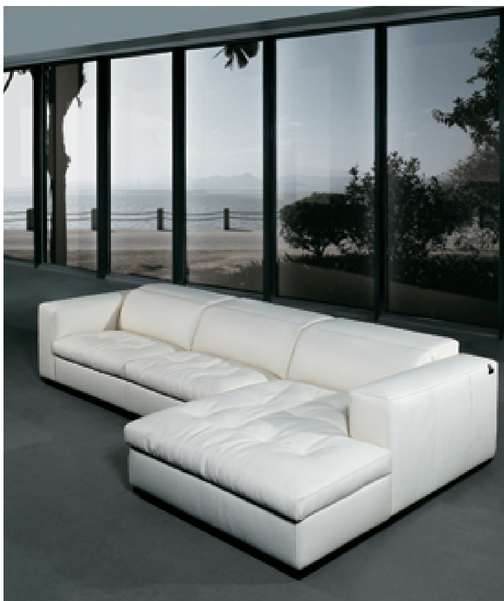
Man-made extra-wrinkle effect (with tuftings) on seat cushions brings up the leather luxury and helps maintaining the cushion appearance after years of sitting.