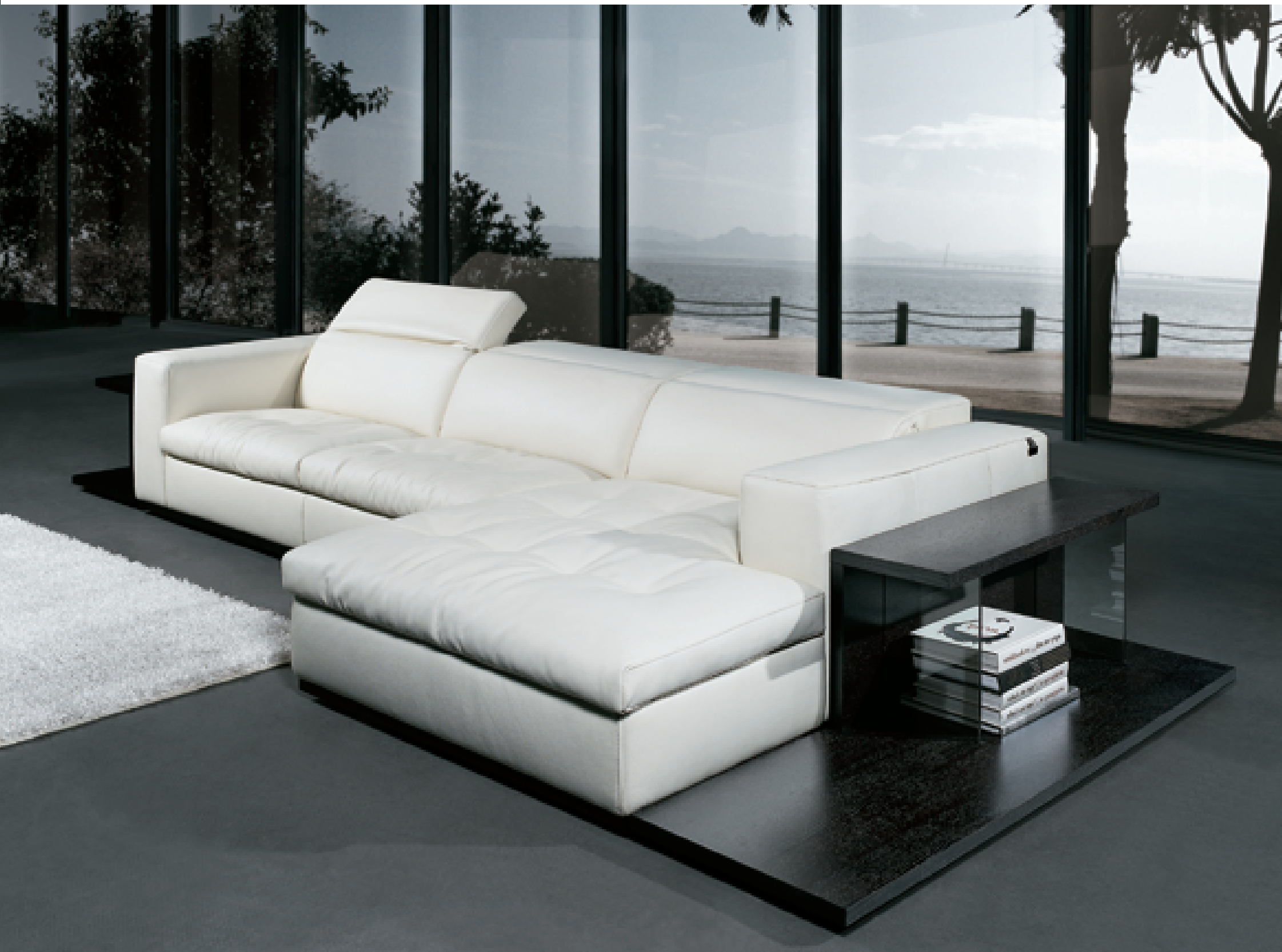
Square-shaped solid wood foot base, comes with wenge color, goes all the way around the sofa base enhance the luxury look of Model RIVA I .