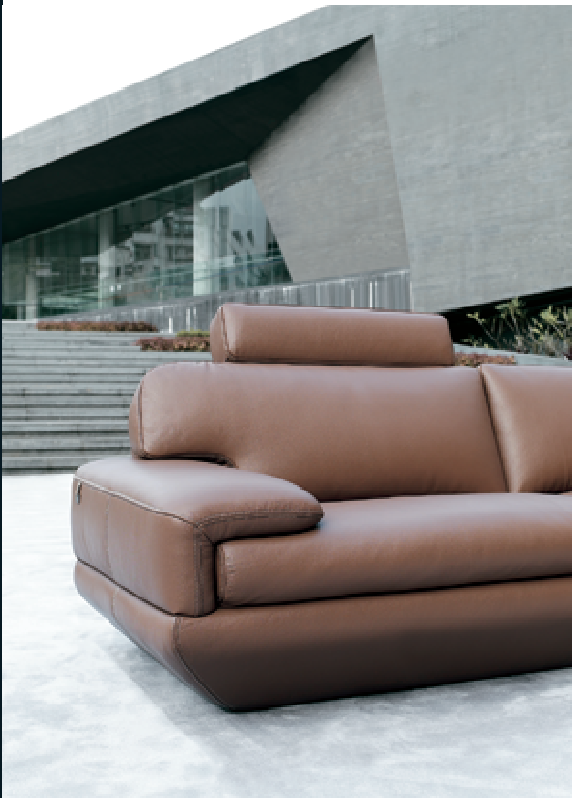
Optional head rest (no. HR2) delivers extra comfort.

Being inspired by the shape of a pyramid upside-down, the seat frame base of Model PERINI gives you a fresh-new look of modern contemporary sofa style.