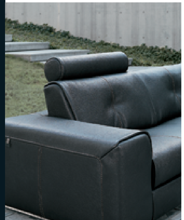
Optional head rest (no. HR2) delivers extra comfort.