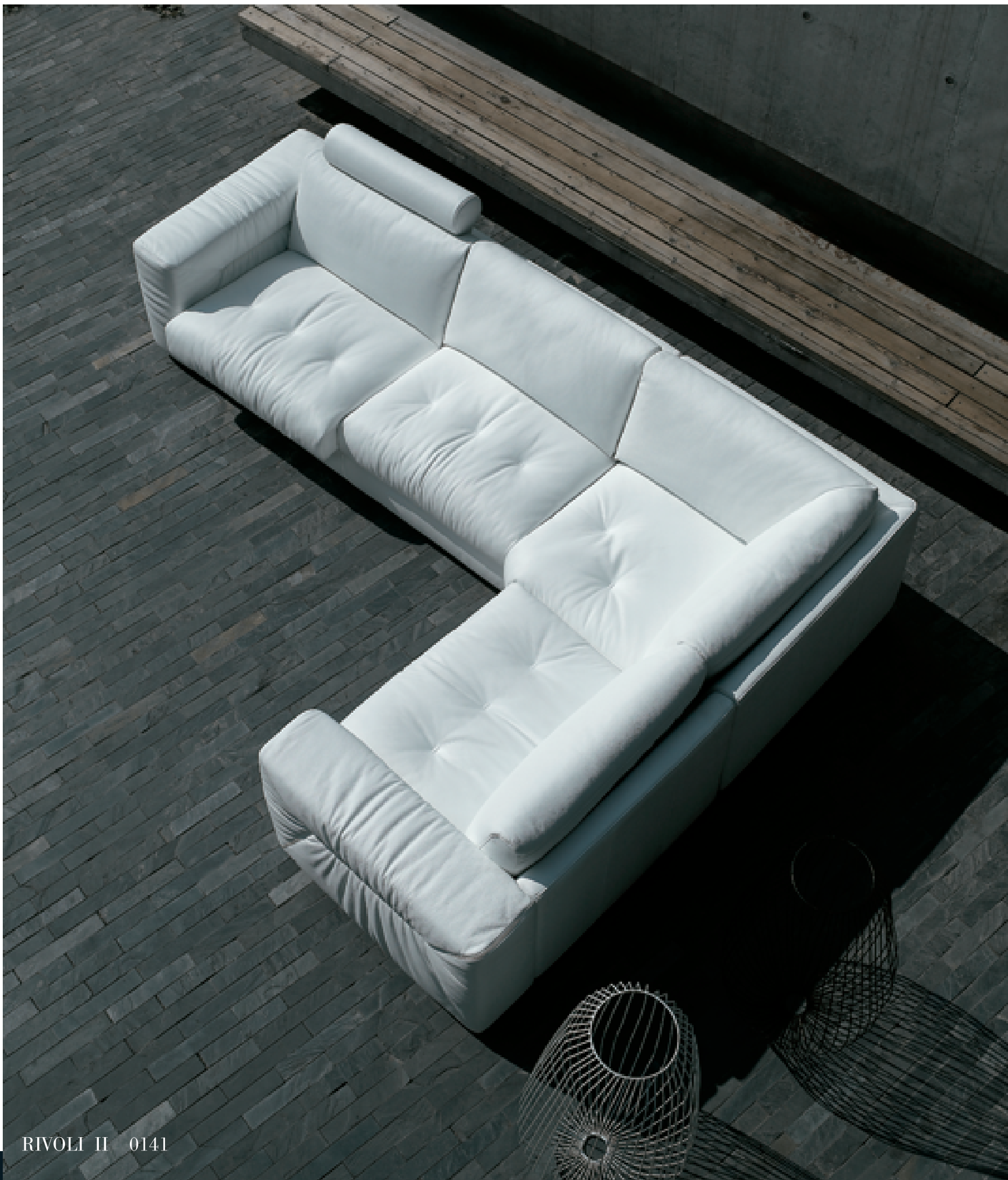
RIVOLI II 0141