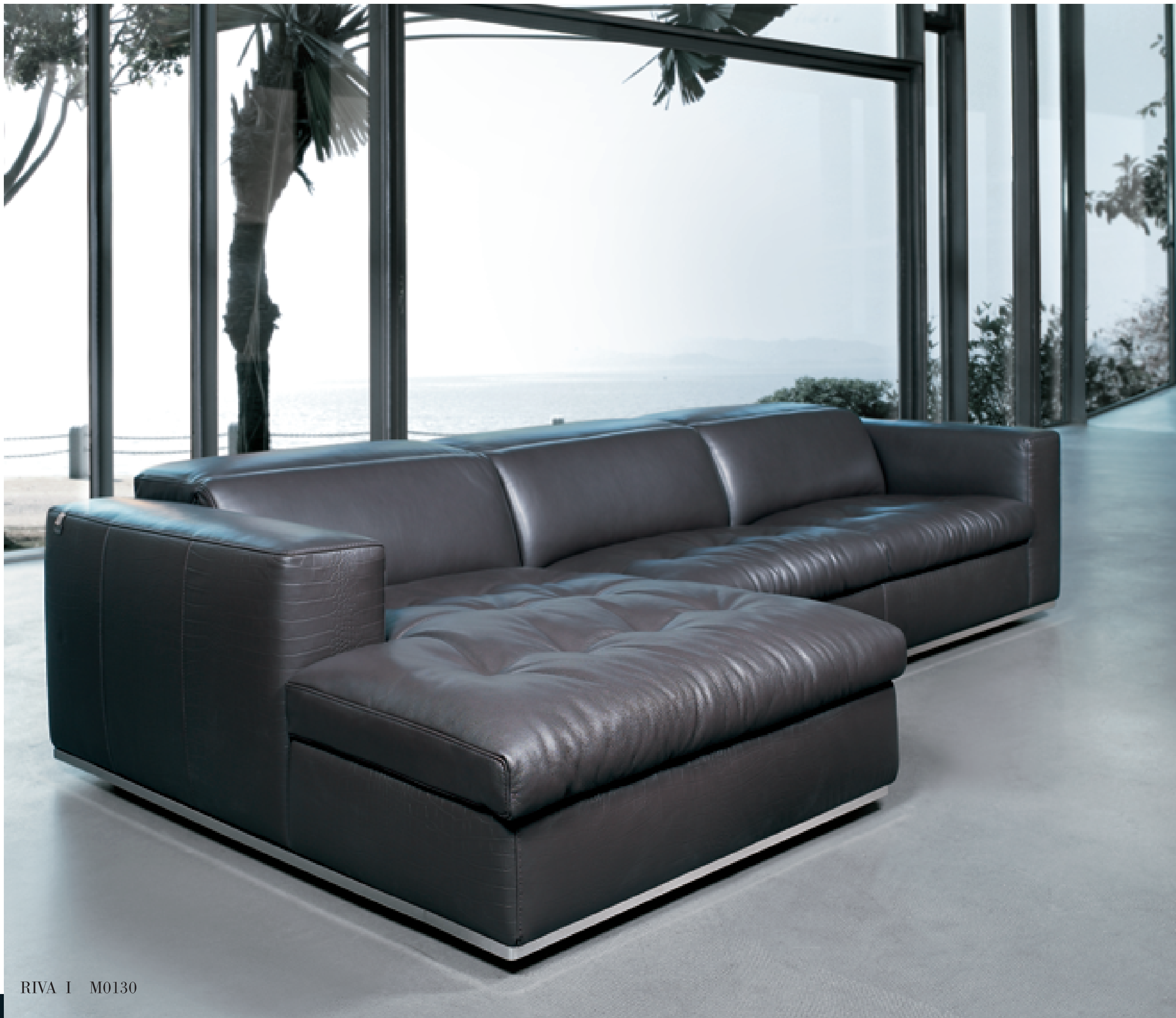
RIVA I M0130