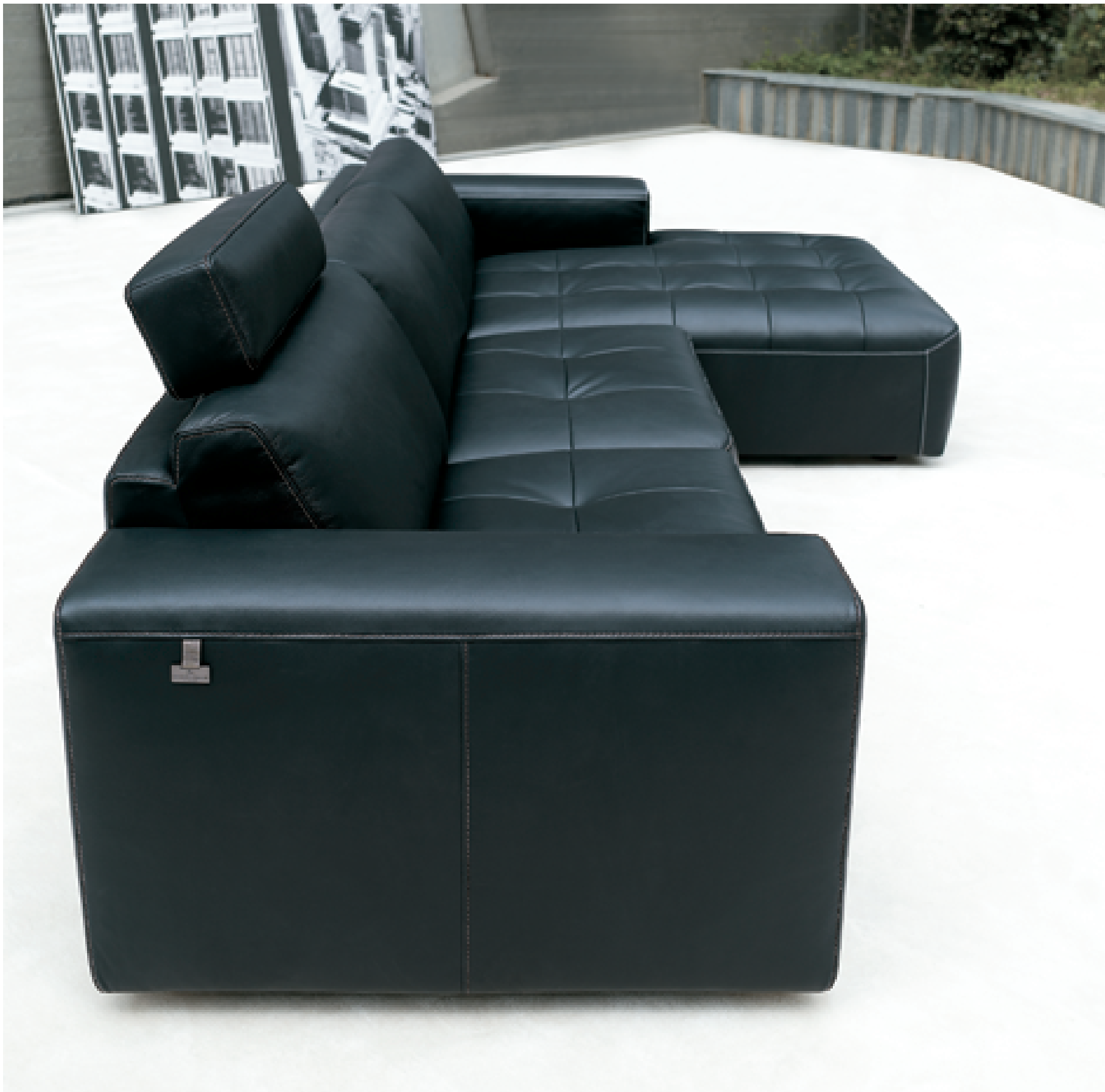
Optional head rest (no. HR2) delivers extra comfort.

The up-side-down U-shape solid stainless steel fixture at the arm front highlights the design uniqueness of Model LEVICE II.