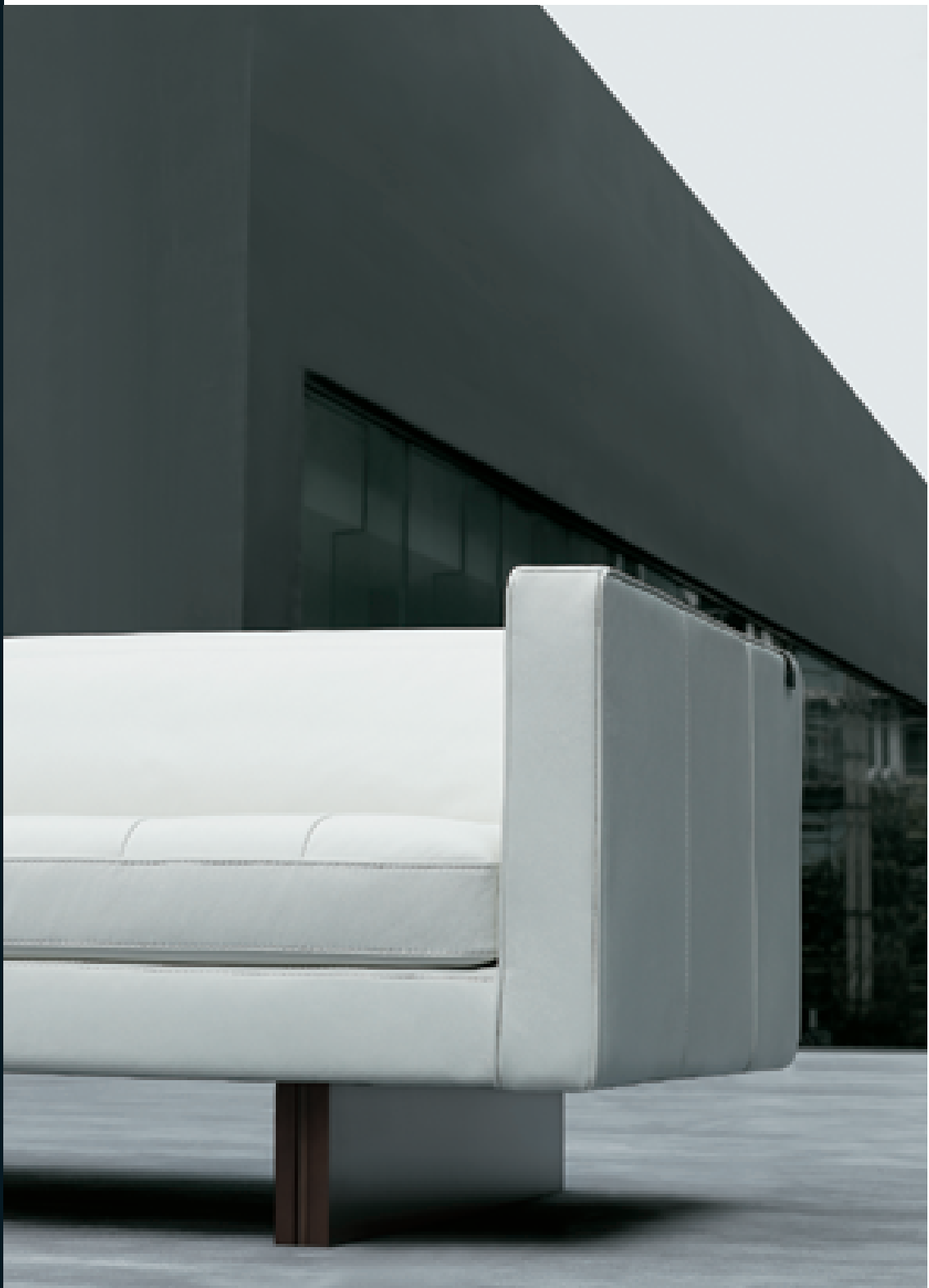
The slim and strong (solid wood in wenge color) “double” legs match perfectly with the slim & clean design of the sofa arm and seat frame. The leg is a one-piece wooden panel that runs all the way from the front to the back of the sofa.