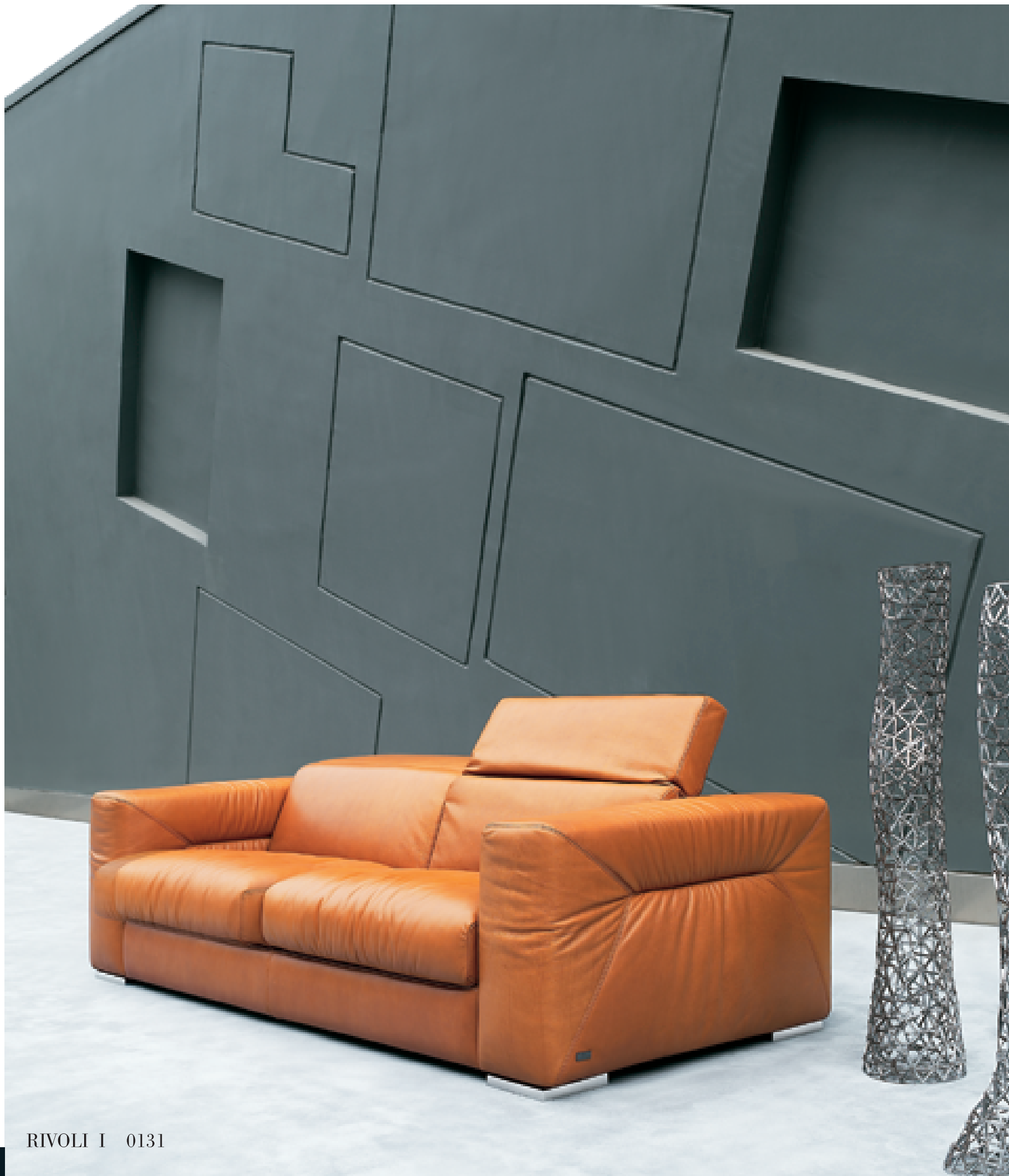
RIVOLI I 0131

German-made head mechanisms (with various locking positions) allow extra comfort when needed.