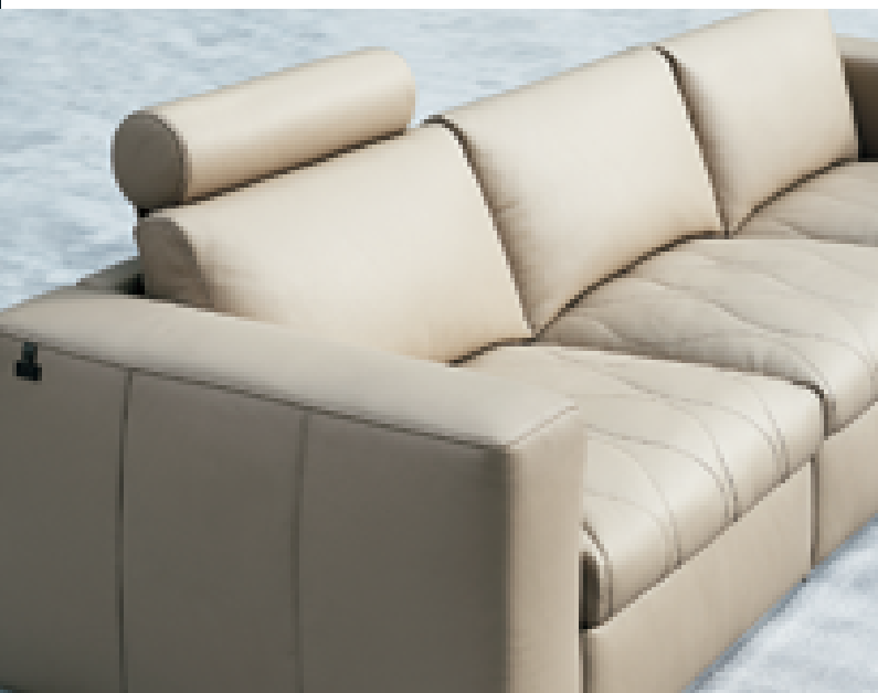
Optional head rest (no. HR2) delivers extra comfort.