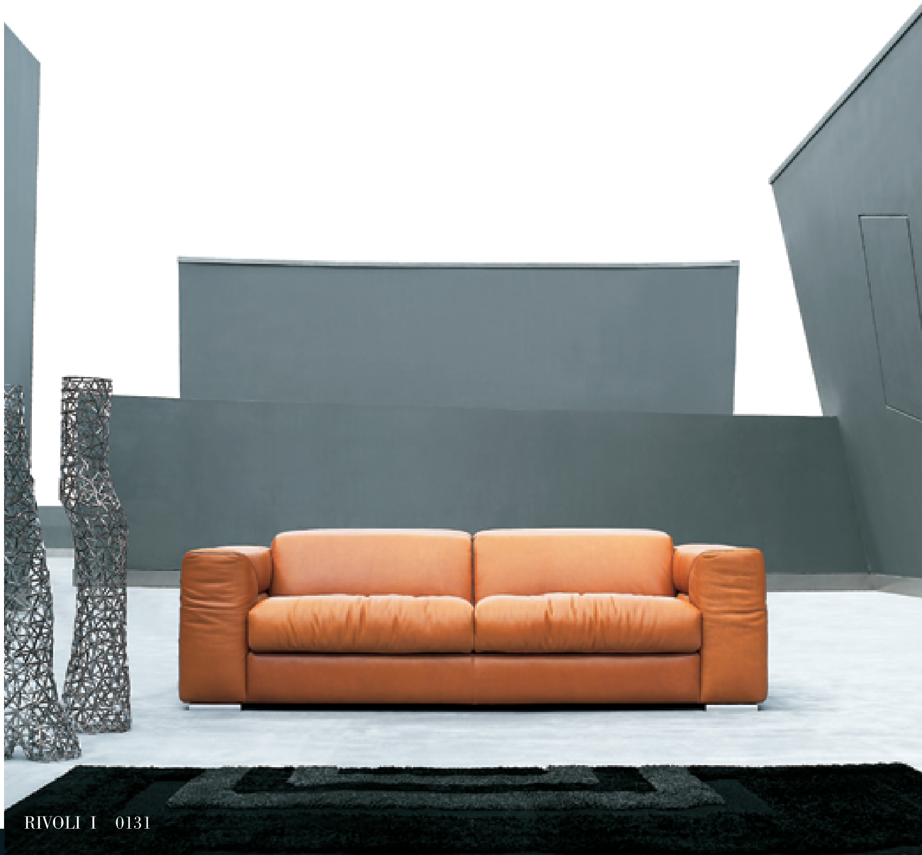
RIVOLI I 0131