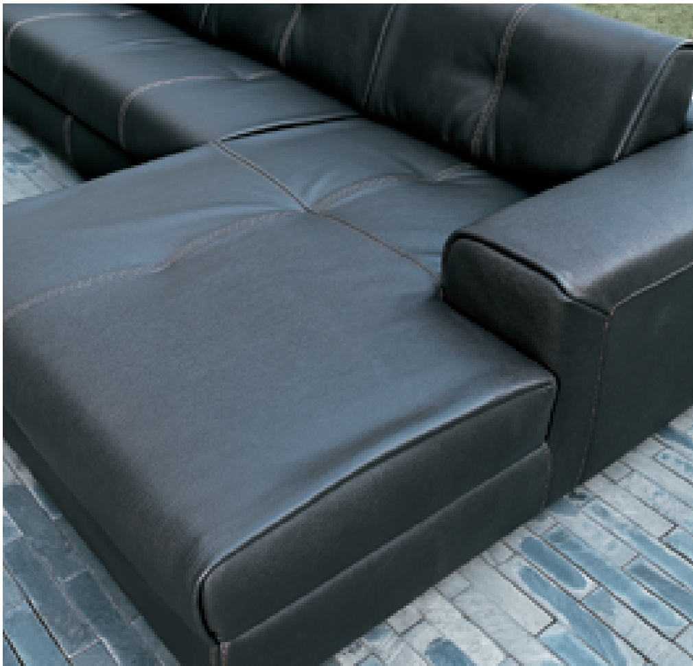
Both back and seat cushions are tufted to create a nice pitch for comfortable seating.