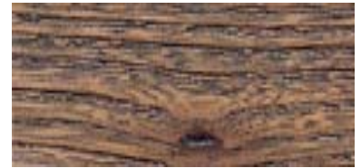
#174 Roasting Elm (Olmo Tueste)