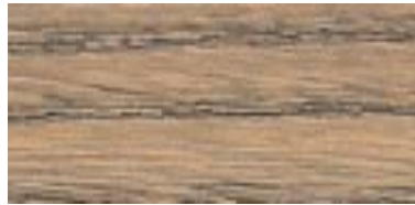
#172 Sand Elm (Olmo Arena)