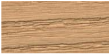
#171 Natural Elm (Olmo Natural)