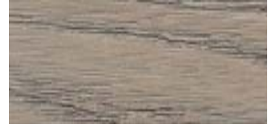
#173 Ash Elm (Olmo Ceniza)