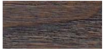
#175 Mount Elm (Olmo Tiede)