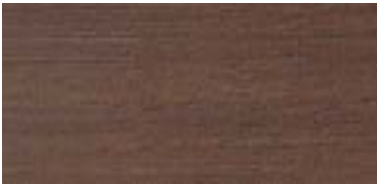
#177 Coffee Walnut (Nogal Café)